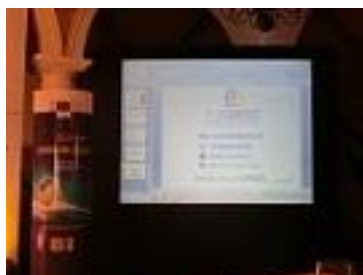
EURAXESS Links India proposed concrete collaboration actions to EqUIP Platform

João Cravinho, Ambassador of the European Union to India said: "The European Union is proud to support 10 European countries joining forces with Indian Council of Social Science Research to enhance networking and coordination in social sciences and humanities. This cross-cutting discipline is crucial for enhancing the socio-economic impact of research and for evidence-based policymaking".