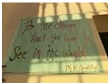
Encouraging posters by students at UD