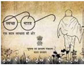
Clean India Campaign logo

This action plan by DU is linked to the Prime Minister's initiative Swachha Bharat Abhiyaan (Clean India Campaign) that was launched nationwide on 2 nd October 2014 on the date of Ghandi's birthday anniversary. The campaign is India's biggest ever cleanliness drive and 3 million government employees and schools and colleges students of India participated in this event (see related news under section 4.2.1. of the Newsletter)