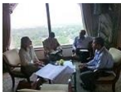
Working group in action