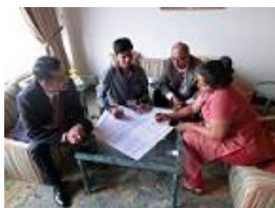
Working group reflecting

The official launch of EqUIP Platform was part of a whole day event on 'Opportunities for Europe-India cooperation on Social Sciences and Humanities' that EURAXESS Links India offered to twenty seven researchers of its network.