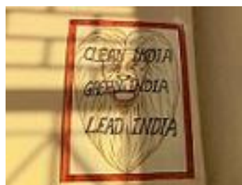
Older and younger leaders are inspiring students to bring their share in the Clean India campaign