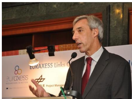
EU Ambassador Dr. João Cravinho at the office inauguration on 3 rd November 2014