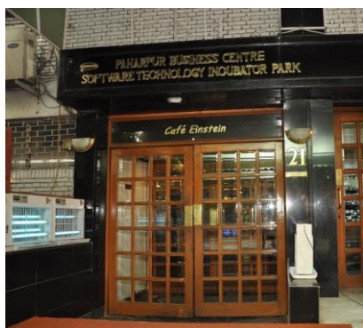
EURAXESS Links Office Paharpur Business Centre (303) 21 Nehru Place Greens New Delhi 110019

On 3 rd November 2014 the inauguration of EURAXESS Links Office hosted by PT-DLR (Project Management Agency – German Aerospace Center) took place in New Delhi . It was a joint event with two other German organisations (i.e. Forschungszentrum Jülich and University of Cologne). The three organisations will share a common office space at Nehru Place. The new meeting point will be ready to welcome you after 15 th November. Please enquire for appointments with the EURAXESS Links India Representative via phone or email before stopping by. EURAXESS Links India will also be present at the following events: