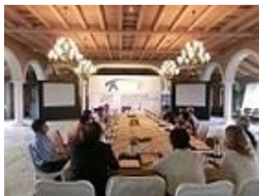
Discussion in plenary

EURAXESS Links India started the school year actively participating at the launch of the 'EU-India Social Sciences and Humanities Platform (EqUIP)' on 14th October in New Delhi (see more on EqUIP Platform under section 4.3.1).