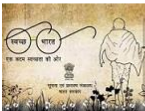
Clean India Campaign logo

By sweeping dirt on the pathway to Balmiki Sadan, a historic temple complex inside a spartan Delhi colony of sanitation workers, Narendra Modi thrust Mahatma Gandhi and one of his fading ideals back into public imagination in a rapidly modernising India.