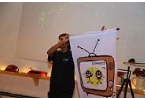
Priti's foldable EURAXESS TV

Of course! I think as scientists we should be very enthusiastic to take science to the common people, and especially to the younger people.