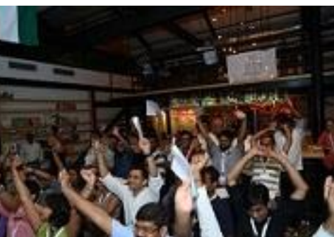
The audience stretching in response ☺

The live presentation had posed other kinds of challenges. After creating the video, I had the basic framework for the presentation, but I think having it as a monologue like video wouldn't have been a fun way of doing it. I had the challenge to make it interactive, interesting, entertaining and yet complete in just 10 minutes.