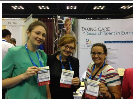
European researchers based in North America visiting our booth.